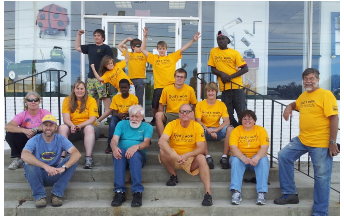
Trinity Lutheran Chelmsford workday at the ReStore, 2013

Homelessness Forum Trinitarian Congregational Church 54 Walden St. in Concord, MA March 2 from 3:00-5:00