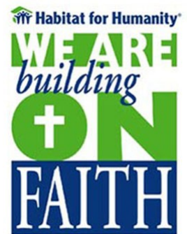
First Parish Church United, Westford at Rock St. 2013