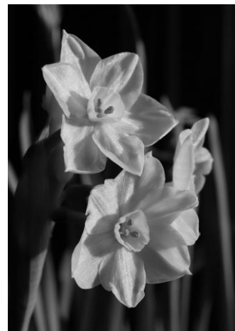
Bulbs, eventually flowers, symbolizing preparation and waiting at Advent