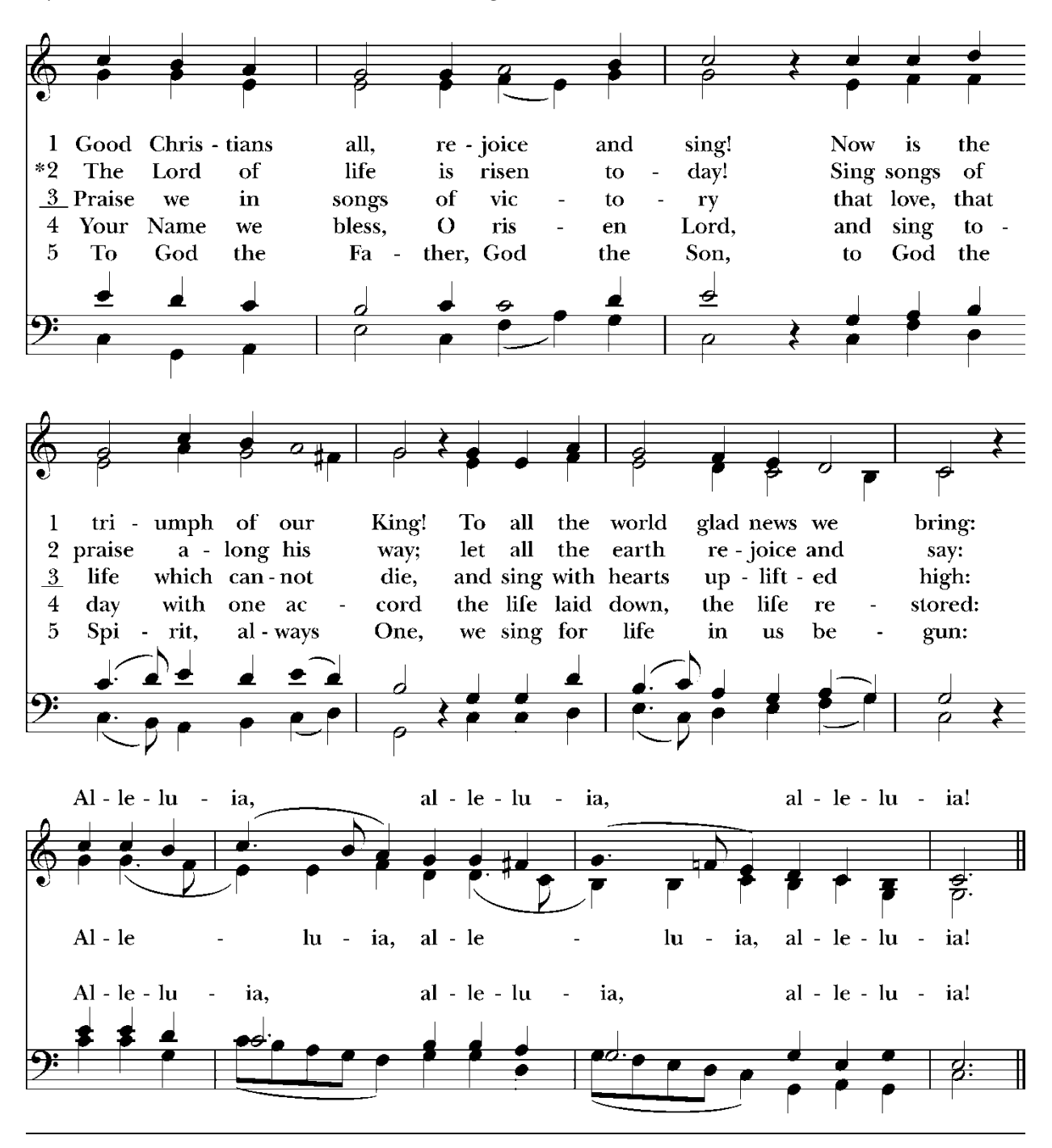
Used by permission: OneLicense #M-400579