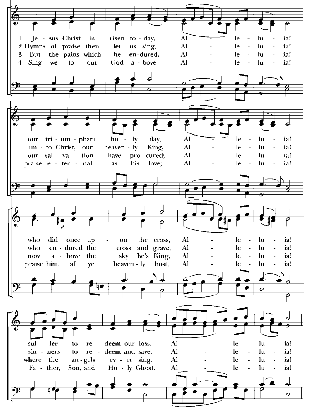
Used by permission: OneLicense #M-400579