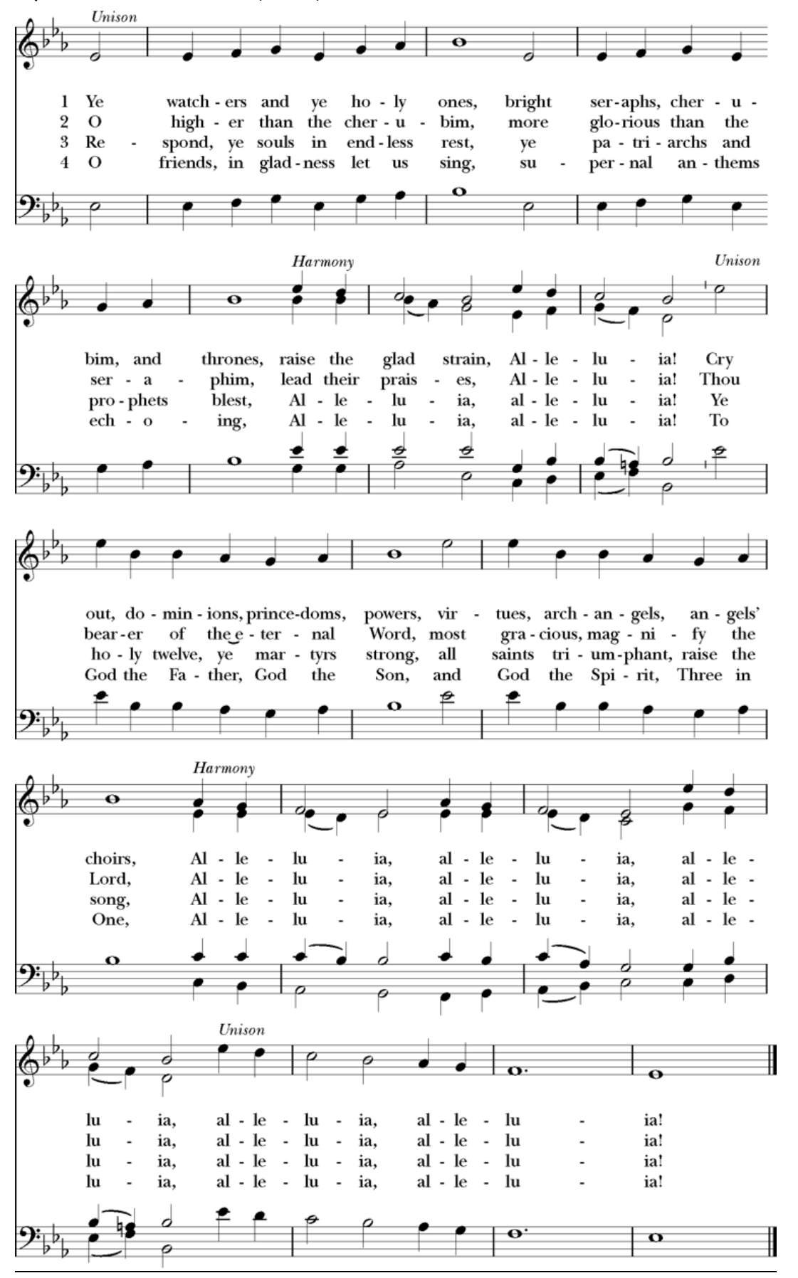
Used by permission: OneLicense #M-400579